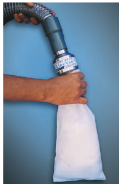
The low cost Model 130200 2" (51mm) Light Duty Line Vac conveys fibers to fill pillows, stuffed animals, diapers, etc.