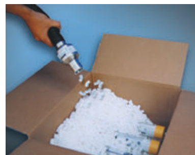
A Model 130125 1-1/4" (32mm) Light Duty Line Vac can fill or empty the packing peanuts from shipping cartons.