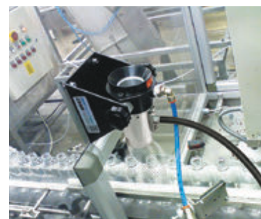
The Model 8292 Gen4 Ion Air Cannon System eliminates the static and dust prior to filling the bottles.