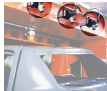
(3) Gen4 Ion Air Cannons blow contaminants from car bodies prior to painting.