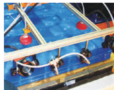
Model 8192 Gen4 Ion Air Cannons provide static elimination in between solar panel lenses to assist separation of the lenses during production.