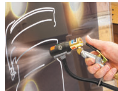
The Model 8293 Gen4 Ion Air Gun cleaning artwork and glass prior to framing.