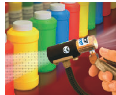
The Model 8293 Gen4 Ion Air Gun neutralizes and cleans plastic bottles prior to labeling.