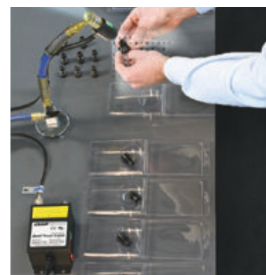
The Gen4 Model 8910 Instant Static Elimination Station removes contaminants on plastic fittings prior to packaging.