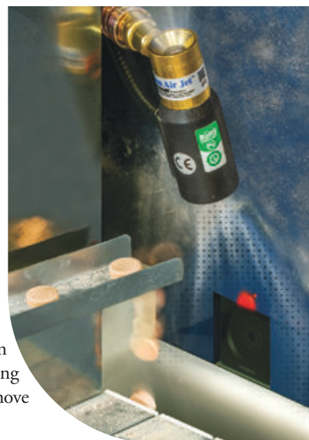
The Model 8294 Gen4 Ion Air Jet with Gen4 Power Supply neutralizes static and removes dust from a counting sensor window on a tablet production machine.