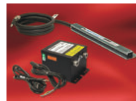
Model 8006 6" (152mm) Gen4 Ionizing Bar and Model 7960 Gen4 Power Supply.

Special length Gen4 Ionizing Bars up to 118" (3m) are available. Please contact our factory.