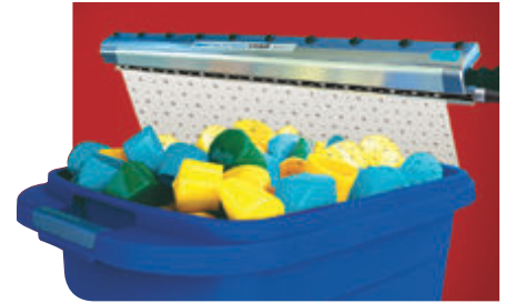
The Model 8218 18" (457mm) Gen4 Standard Ion Air Knife System showers parts with static eliminating ions to prevent personnel shocks.

Compressed air inlets are provided on each end of the Gen4 Standard Ion Air Knife. For long spans, multiple Gen4 Standard Ion Air Knives can be mounted end-to-end. This produces an air gap at the connection end of about 2" (51mm). (If no air gap is desired, use the Gen4 Super Ion Air Knife.) Special length Gen4 Ionizing Bars up to 119" (3.02m) are available for multiple air knife applications.