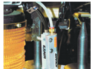
A Model 8103 3" (76mm) Gen4 Standard Ion Air Knife removes dust from computer hard disks prior to assembly.