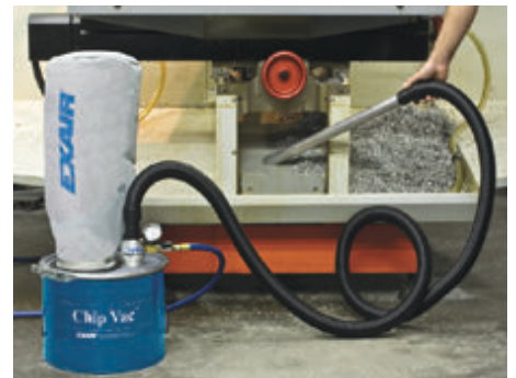
The Mini Chip Vac allows for easy clean up of small messes.