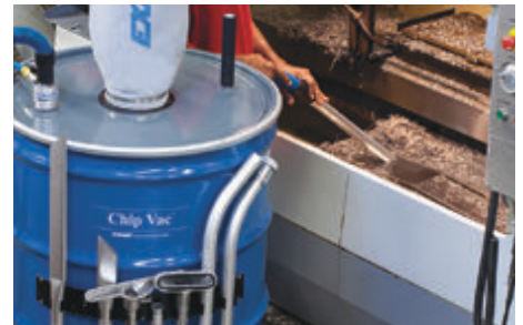
110 Gallon Chip Vac offers maximum capacity cleanup on a large machining operation.