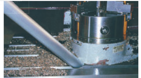
The Chip Vac removes abrasive stainless steel chips from a CNC.

The Chip Vac Systems include a drum lid with a locking ring that fits an open top drum. In less than a minute, the Chip Vac can be removed and easily placed onto another drum to keep different materials separate for recycling. Constant heavy lifting and dumping of the vacuum cleaner tanks is eliminated since all chips are vacuumed directly into the drum.