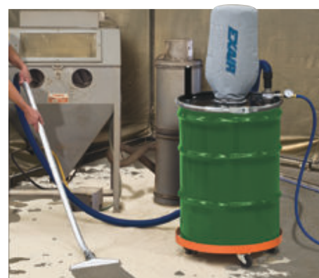
Sand that covers the floor around a sand blaster is quickly vacuumed into the drum using the rugged floor tool.