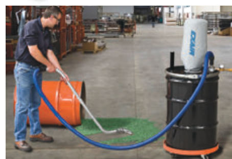
The Heavy Duty Dry Vac cleans up a spill of tumbling media.