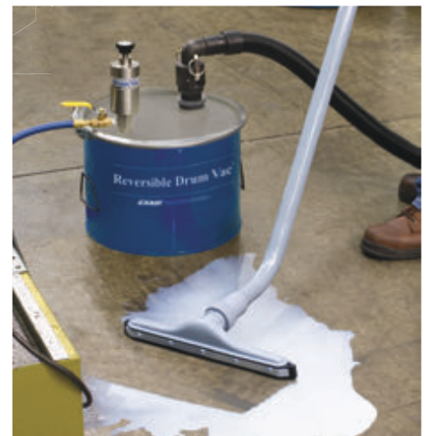
Model 6901 Spill Recovery Kit used with the Mini Reversible Drum Vac provides fast cleanup of messy spills.