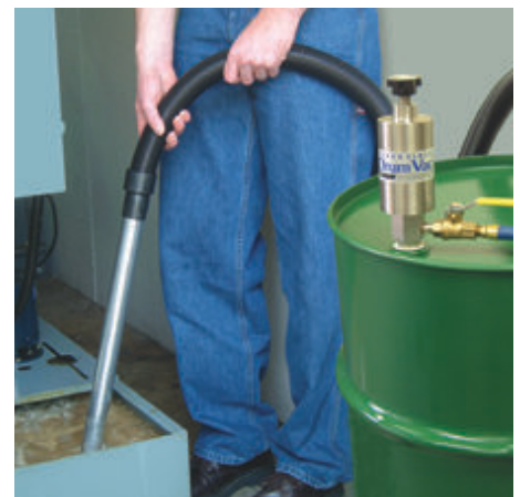
Reversible Drum Vacs are designed to fit the 3/4 NPT bung of any closed top drum. This Model 6196-30 30 gallon system empties the coolant sump of a CNC.