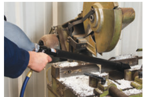
Model 6392 Vac-u-Gun All Purpose System removes plastic shavings from a saw.