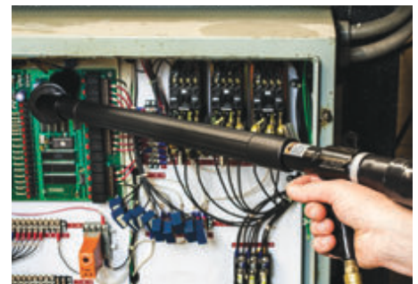
Model 6292 Vac-u-Gun Transfer System carries dust away from sensitive electronic controls.