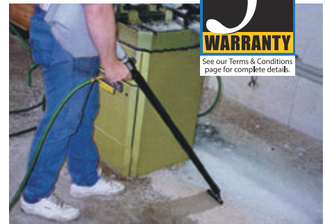
Model 6192 Vac-u-Gun Collection System vacuums absorbent and chips.

Built to Last 5yr. WARRANTY See our Terms & Conditions page for complete details.