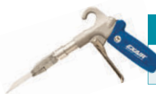
Model 1244 Soft Grip Super Air Scraper Nozzle: 1144 1/4 NPT 2" Super Air Scraper