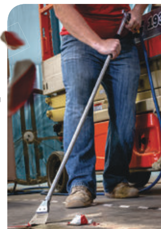
The Model 1244-36 scrapes and blows old tape off a concrete floor.