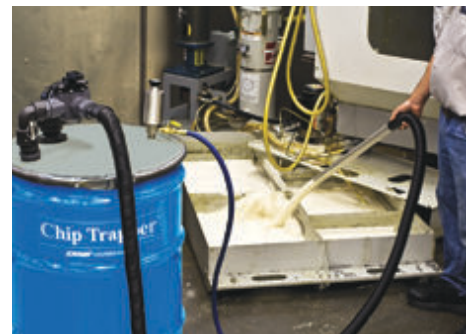
The Chip Trapper pumps the coolant back into the sump – free of chips and debris.

A sudden lack of coolant flow in a machining operation will likely damage the part and expensive tooling. Machine tools commonly discharge some chips and shavings into the coolant sump. As the chips accumulate and mound up, the coolant flow used to flood the part and tooling becomes restricted. Some high pressure coolant systems sound an audible alarm and abruptly shut down the machine when low coolant flow occurs. This results in downtime to fix the problem and clear the alarm. That isn't the case with standard machines where immediate damage can occur if the operator fails to spot the lack of coolant. Regular cleaning of the coolant sump with the Chip Trapper can quickly eliminate this very costly problem.