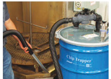
Chip Trapper filters out solids from parts washer fluids.