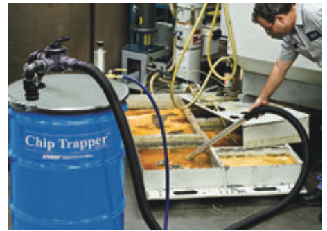
The Chip Trapper vacuums dirty coolant and chips into the drum.

SCAN & WATCH the video! https://exair.co/04-ctrvid